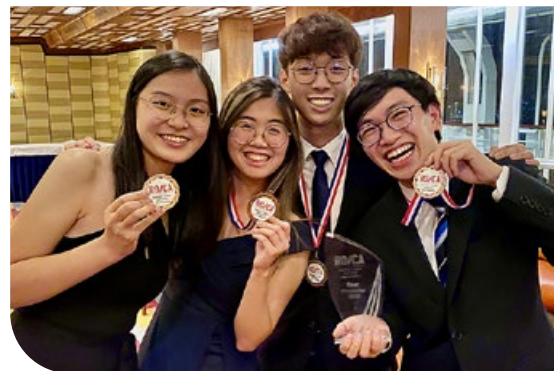
Rotterdam/Carleton International Case Competition 2022