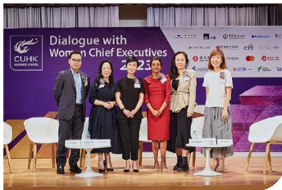
Dialogue with Women Chief Executives 2023

A highlight of business education, case competitions underpin your leadership development by letting you to practice working in a team, creating solutions for real-life business problems, and presenting your ideas to a panel of judges. CUHK Business School holds an annual Academic Cup to give students a taste of case competitions, and students who perform exceptionally well may be invited to represent CUHK in local and international competitions. It is an excellent opportunity not only to receive expert guidance but also to gain international experience and expand their professional network.