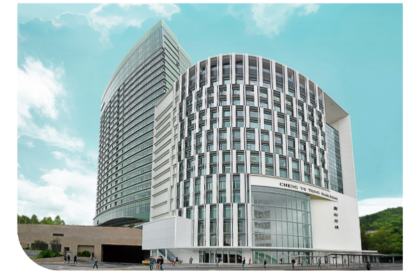
CUHK Business School

Founded in 1919, the Darla Moore School of Business is a recognised leader in international business research and education. For nearly two decades the school's undergraduate international business programme has been ranked first amongst American universities by U.S. News & World Report. The school offers great depth and breadth in the study of complex opportunities and risks inherent in international business.