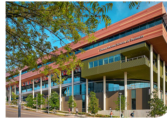
Darla Moore School of Business, UofSC

“The exclusive curriculum equips rising leaders with comprehensive international business knowledge, expertise on U.S. and China business relations, as well as growth strategies for Chinese enterprises.”