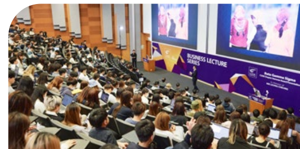
Business Lecture Series