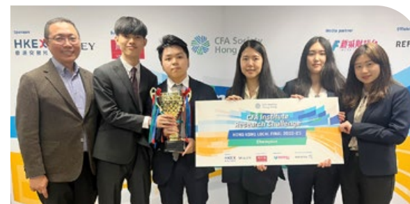
CFA Institute Research Challenge - Hong Kong Local Final 2022-23