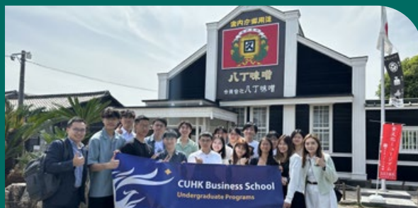
Study Tour to Nagoya