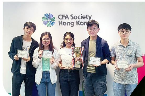
CFA Research Challenge