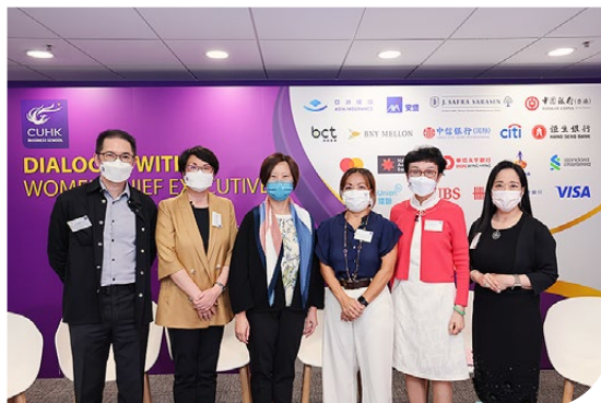
Dialogue with Women Chief Executives

“ 95% Students complete at least one internship prior to graduation ”