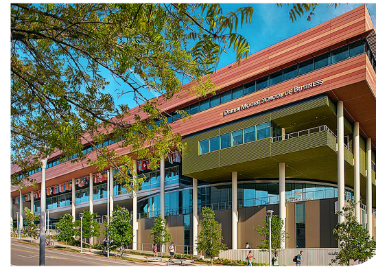
Darla Moore School of Business, UofSC