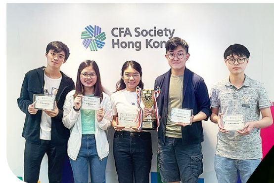
CFA Research Challenge